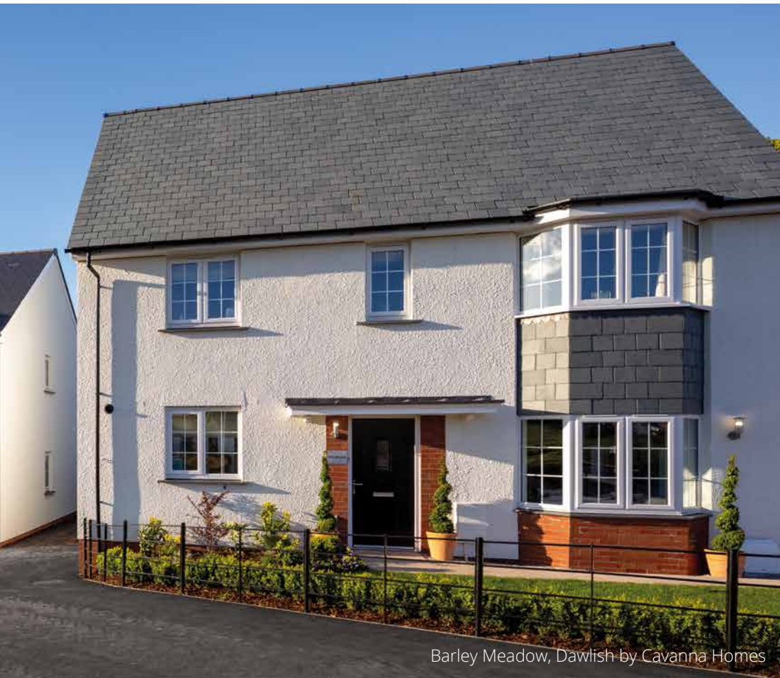
Barley Meadow, Dawlish by Cavanna Homes

Cavanna use the finest materials selected for longevity, function and performance. Our attention to detail and quality goes beyond the build, every Cavanna Home comes with contemporary fitted kitchens, the latest heating systems, excellent wall and loft insulation and double glazing as standard. This means your house is thermally efficient, comfortable and beautifully stylish.