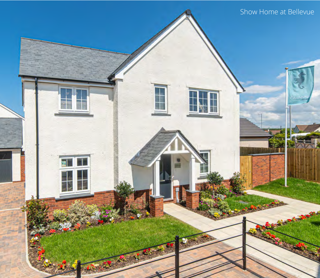
Show Home at Bellevue

Cavanna use the finest materials selected for longevity, function and performance. Our attention to detail and quality goes beyond the build, every Cavanna Home comes with contemporary fitted kitchens, the latest heating systems, excellent wall and loft insulation and double glazing as standard. This means your house is thermally efficient, comfortable and beautifully stylish.